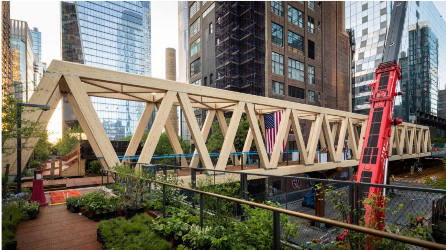
SOM connects block-long glulam bridge to the High Line

The material can be used for cladding on interiors or exteriors and the studio is experimenting on creating larger, self-supporting structures.