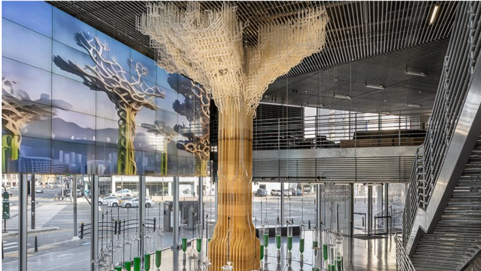
EcoLogicStudio turns algae into air-purifying biopolymer "tree"

Among the events and exhibitions on show are the Loewe Foundation Craft Prize exhibition, which features a spiky ceramic egg and a needle-felted chair, and British artist Samuel Ross' series of massive furniture pieces made from wood, metal and stone.