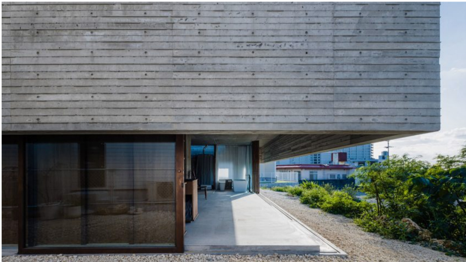
Single concrete column supports One-Legged House in Japan

The 92-metre-long bridge was constructed out of glued-laminated timber (glulam) and is part of the Moynihan Connector, which connects the High Line, an elevated walkway in Manhattan, to the Moynihan Train Hall transit hub.