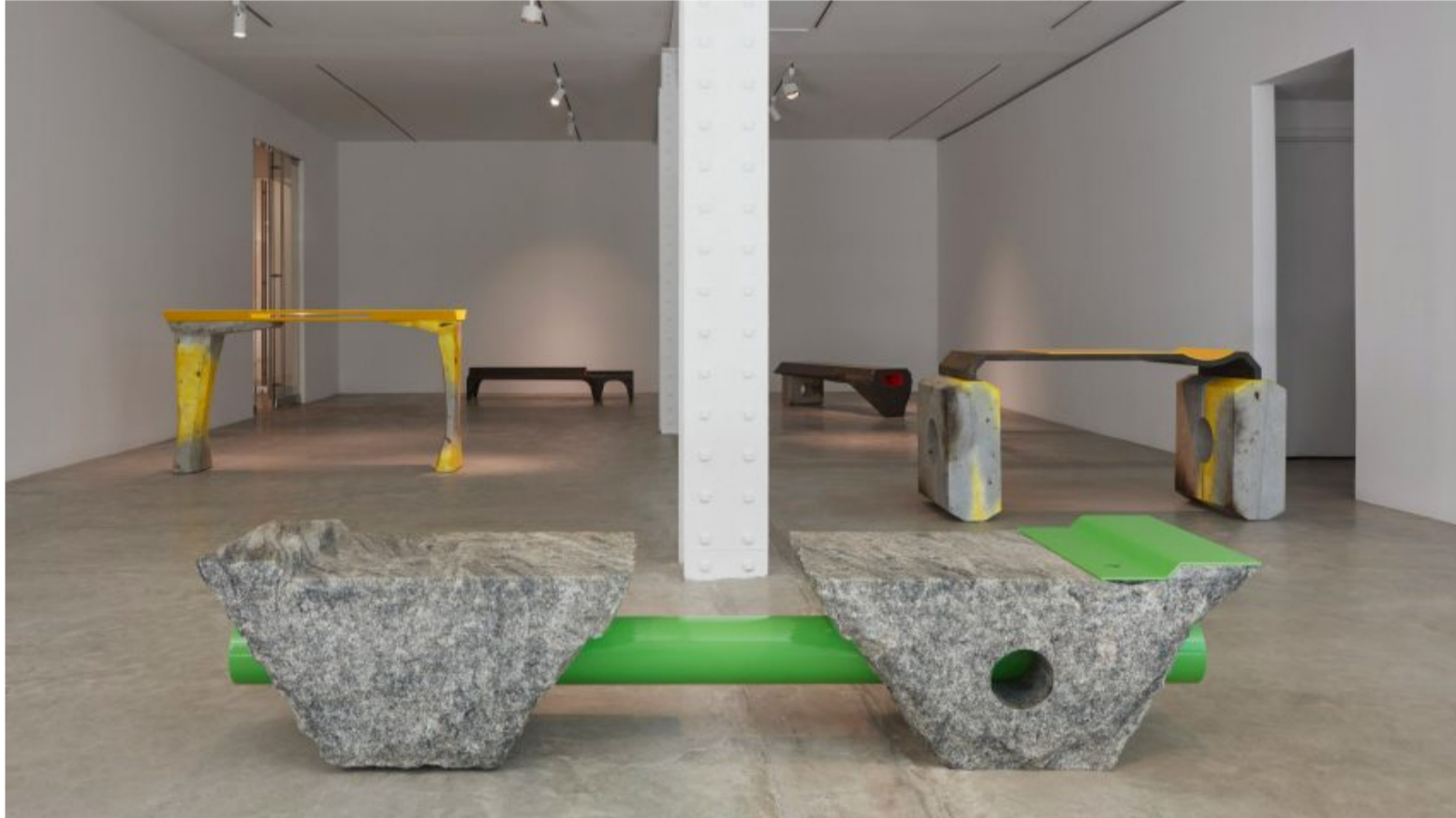
Twelve things to do and see during New York's 2023 design week

Foster was in Venice to unveil his concrete emergency housing project Essential Homes , which he created with buildings materials company Holcim to provide rapidly assembled housing for people displaced by natural and manmade disasters.